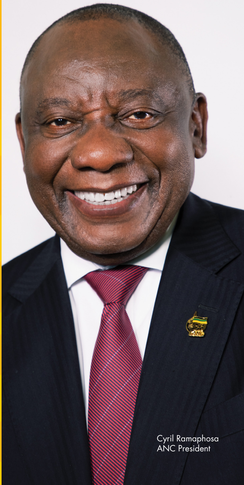
Cyril Ramaphosa ANC President