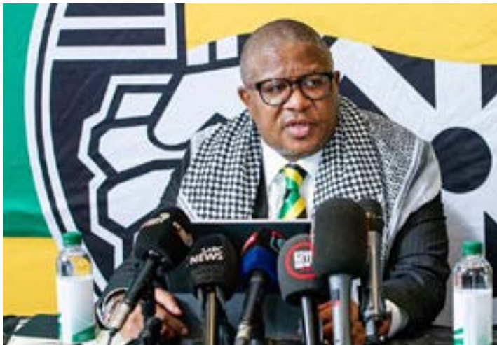
Media Briefing by the Secretary General Cde Fikile Mbalula giving an overview and highlights of issues to be discussed and intended outcomes of the NEC meeting.