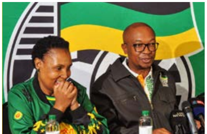
Cde Thembi Nkadimeng and Cde Parks Tau Media briefing on the state of municipalities and social security interventions to maintain a sustainable administration and disbursement of social grants.