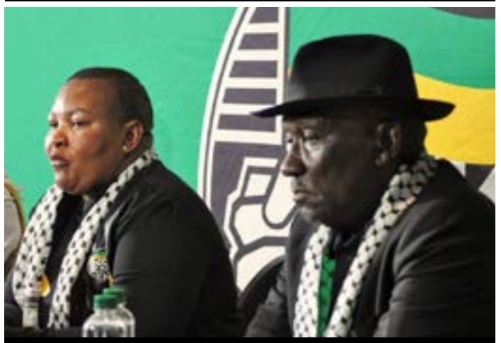
Cde Polly Boshielo and Cde Bheki Cele Media briefing on interventions to tackle illegal mining in South Africa.