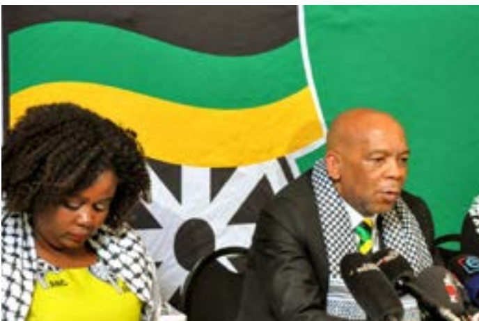
Cde Mamoloko Kubayi; Cde Sputla Ramokgopa Media briefing on the National Energy Action Plan and strides we are making in the implementation of the plan and discussion on challenges with the media.