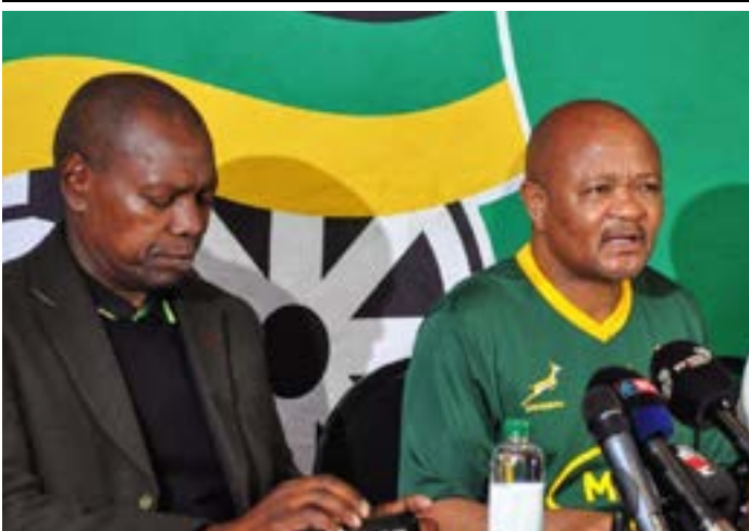
Cde Zweli Mkhize and Cde Senzo Mchunu Media briefing addressing service delivery challenges and local government interventions that are underway.