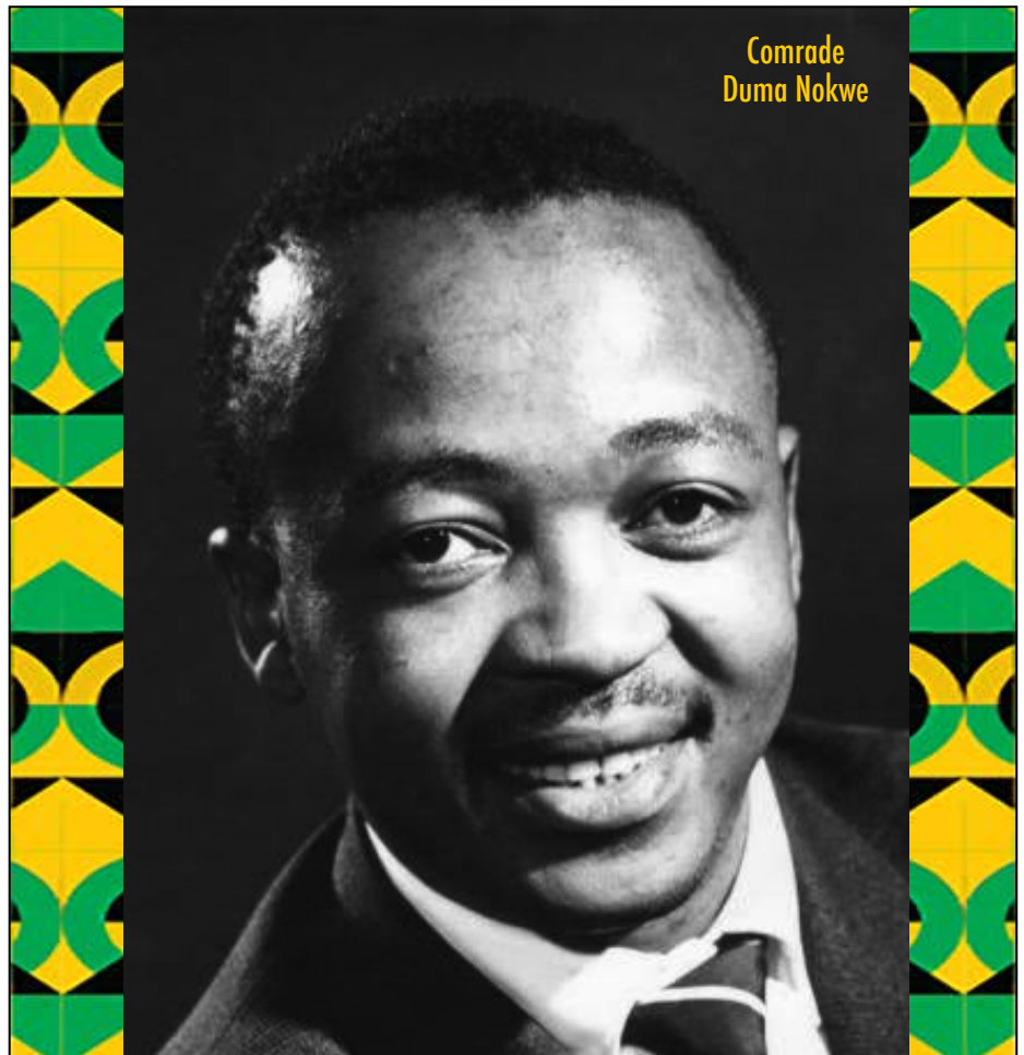
Comrade Duma Nokwe

Conflict resolution mechanisms should also be established to address any disagreements or issues that may arise. A clear and constructive process for resolving conflicts prevents unnecessary tension and ensures that the