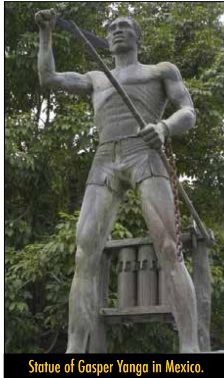
Statue of Gasper Yanga in Mexico.

The phenomenon of the transatlantic slave trade, which spanned centuries and empires, played a pivotal role in shaping the modern world. Karl Marx, in his seminal work, "Poverty of Philosophy" , noted: "Direct slavery is just as much the pivot of bourgeois industry as machinery or credit. Without slavery, there is no cotton; without cotton, there is no modern industry. Slavery gave